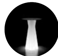
Versione light / Light version

DESIGN MATTEO RAGNI + MAURIZIO PRINA 2015