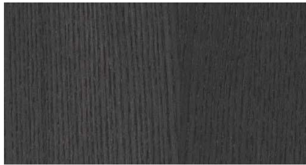
Cod. 01 - Frassino o Rovere Cod. 01 - Ash or Oak