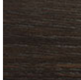
RB burned oak