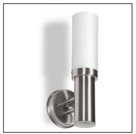
The photograph may not match the reference exactly. Please read the product description to identify the finish.