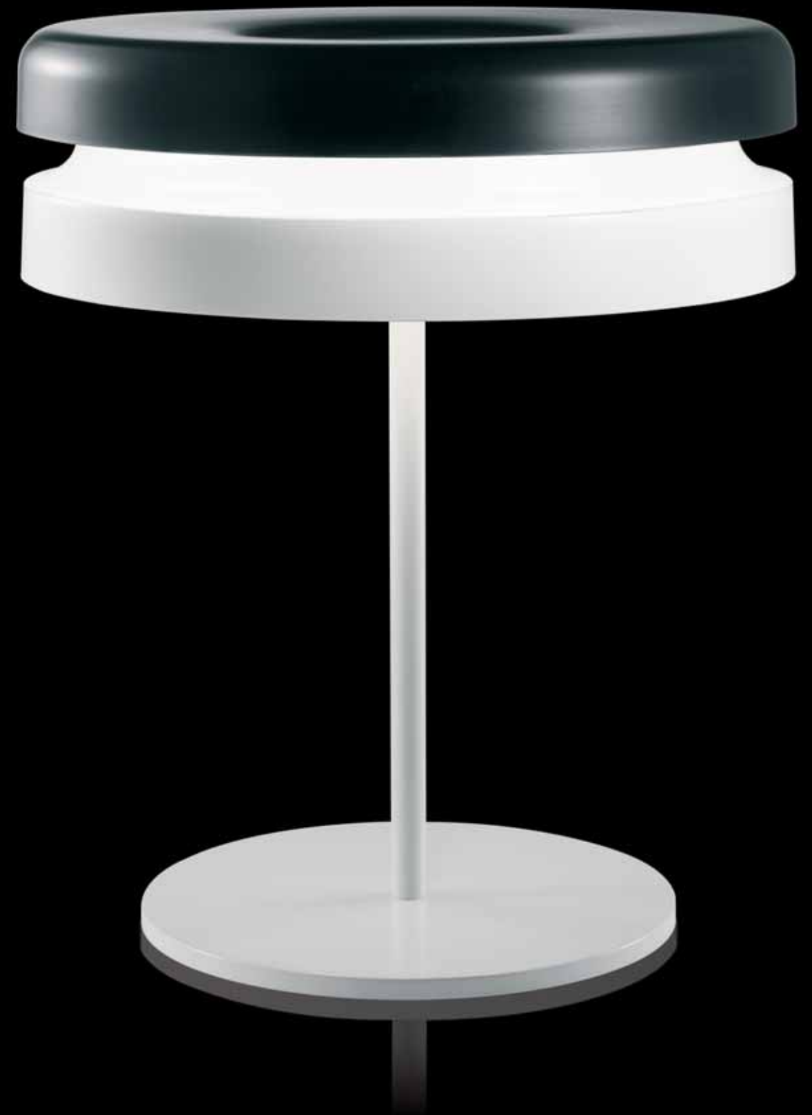
Table lamp with direct light. Structure in white painted metal. Reflector in black/white or orange/white painted metal. Glass diffuser.

Lampada da tavolo a luce diretta. Struttura in metallo verniciato bianco. Riflettore in metallo verniciato bianco/arancio o bianco/nero. Diffusore in vetro.