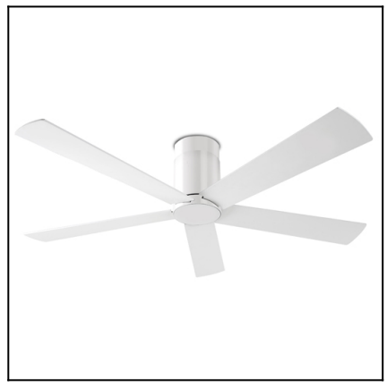
The photograph may not match the reference exactly. Please read the product description to identify the finish.