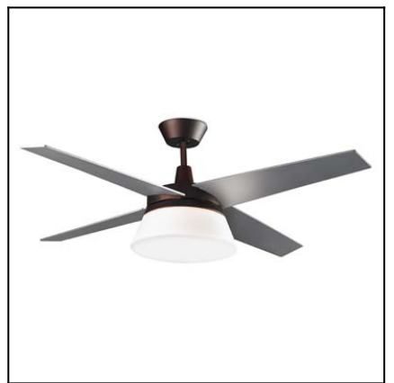
The photograph may not match the reference exactly. Please read the product description to identify the finish.