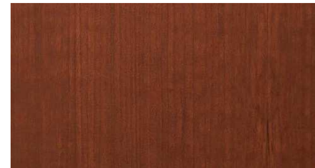
Cod. 12 - Ciliegio Cod. 12 - Cherry