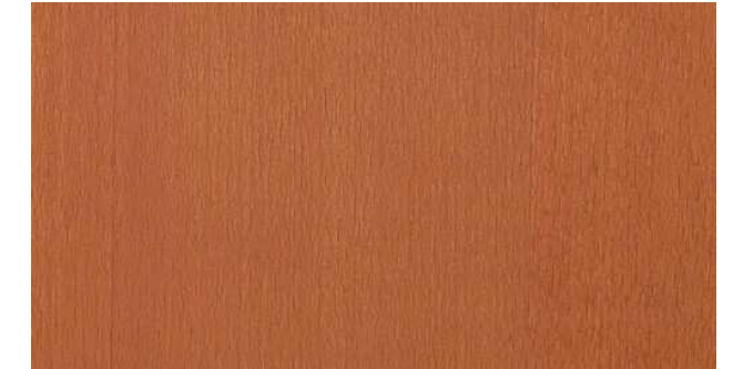
Cod. 14 - Faggio Cod. 14 - Beech