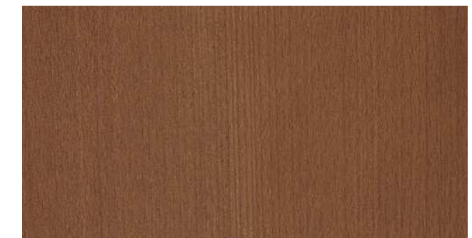
Cod. 15 - Faggio Cod. 15 - Beech

I colori del campionario sono puramente indicativi e sono possibili differenze di tonalità tra una partita di produzione e l'altra. Il legno è un prodotto naturale: baffi, nodi, variazioni di colore e di poro sono le esclusive prove della sua naturale bellezza.