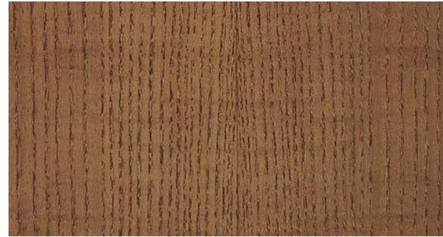
Cod. 05 - Frassino o Rovere Cod. 05 - Ash or Oak