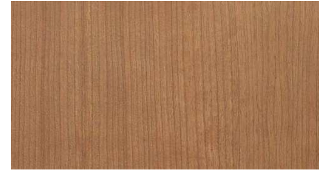
Cod. 11 - Ciliegio Cod. 11 - Cherry