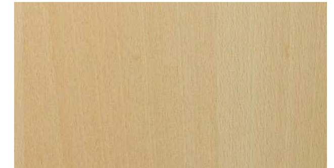
Cod. 13 - Faggio Cod. 13 - Beech