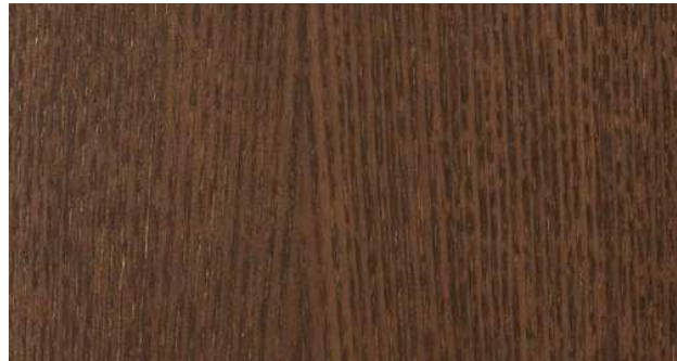
Cod. 03 - Frassino o Rovere Cod. 03 - Ash or Oak