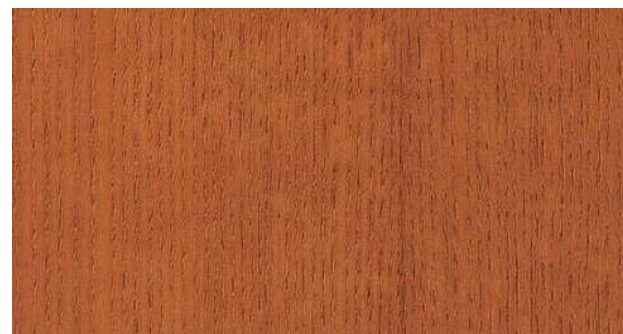
Cod. 08 - Frassino o Rovere Cod. 08 - Ash or Oak