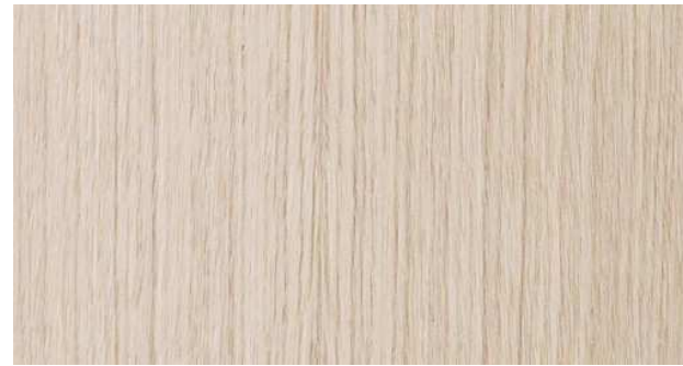
Cod. 06 - Rovere sbiancato Cod. 06 - Light Oak