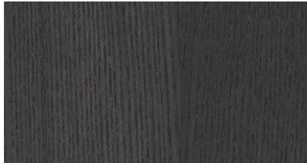
Cod. 01 - Frassino o Rovere Cod. 01 - Ash or Oak