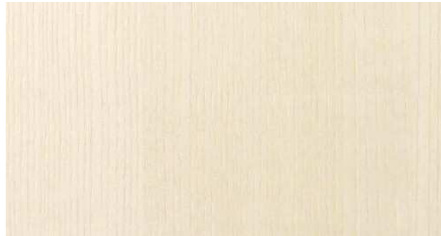
Cod. 02 - Frassino sbiancato Cod. 02 - Light Ash