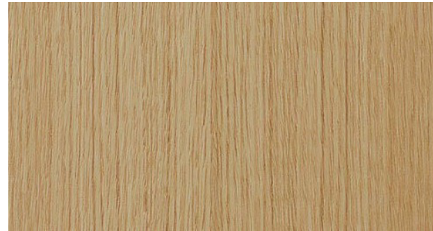
Cod. 07 - Rovere naturale Cod. 07 - Natural Oak