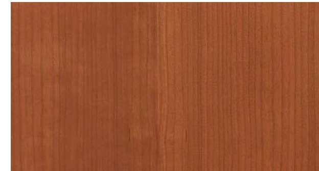
Cod. 10 - Ciliegio Cod. 10 - Cherry