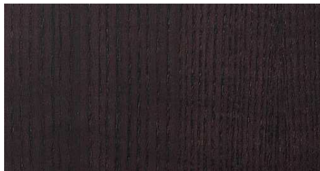
Cod. 04 - Frassino o Rovere Cod. 04 - Ash or Oak