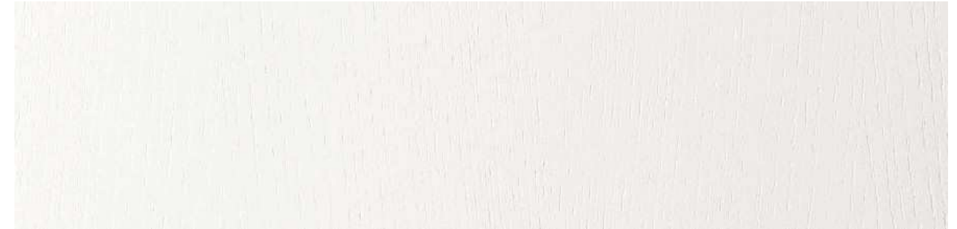
Cod. 09 - Bianco Cod. 09 - White