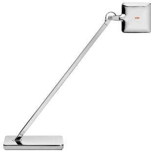
Table lamp providing direct light. Head in pressofused aluminium, diffuser in photo-engraved methacrylate with aluminate surround. Power pack on plug, base in pressofused zamak. Directionable head. ON/OFF switch with Soft Touch technology and light flow adjustment to 2 intensities (100% – 50% – 0%). Power pack on plug with interchangeable plugs.