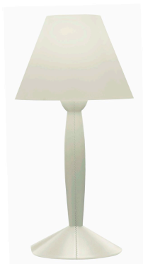
Table lamp providing direct and diffused light. Injection-molded colored polycarbonate lamp body, diffuser and diffuser support.