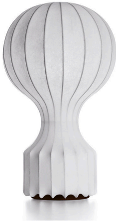
Table lamp providing diffused light. White powder coated internal steel structure sprayed with a unique "cocoon" resin to create the diffuser which is then protected by a transparent sprayed on finish. On the cable there is the electronic dimmer which allows the regulation of light brightness.

by Achille & Pier Giacomo Castiglioni , 1960