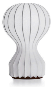
Table lamp providing diffused light. White powder coated internal steel structure sprayed with a unique "cocoon" resin to create the diffuser which is then protected by a transparent sprayed on finish. On the cable there is the electronic dimmer which allows the regulation of light brightness.

by Achille & Pier Giacomo Castiglioni , 1960