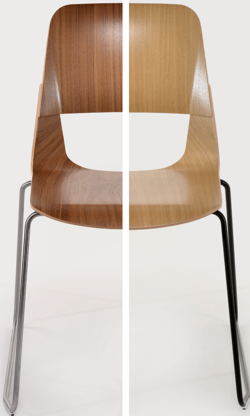
FRIGATE Stacking chair, 2018