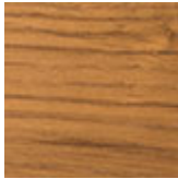
HR Heritage oak