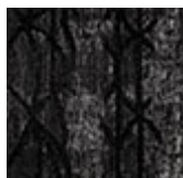
cotton chenille Mumbai