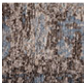
cotton chenille Radja