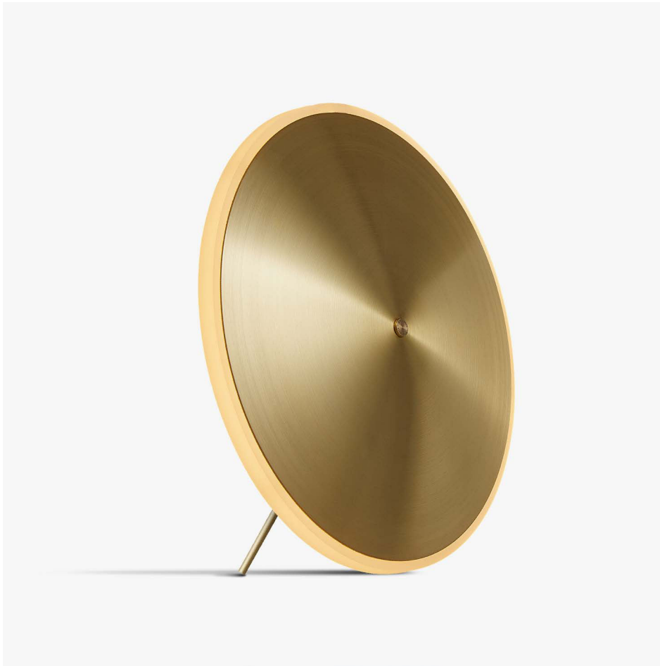
Table10 Brass GP2011-B