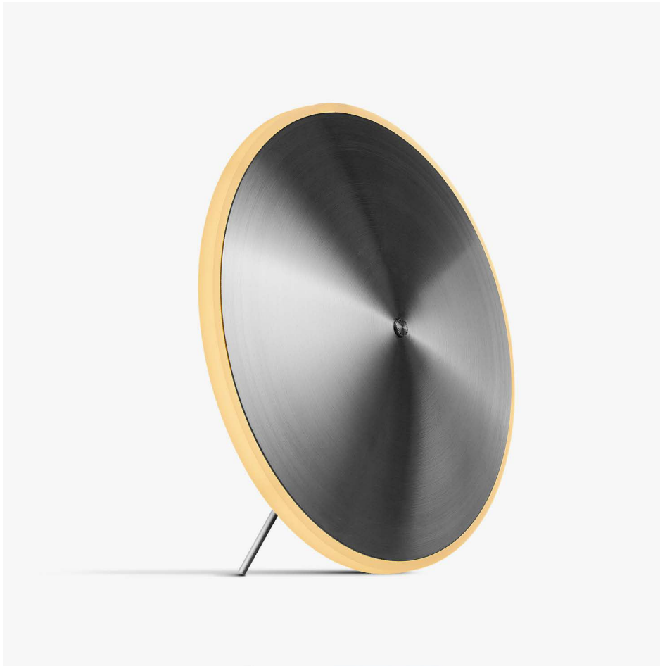
Table10 Steel GP2011-S