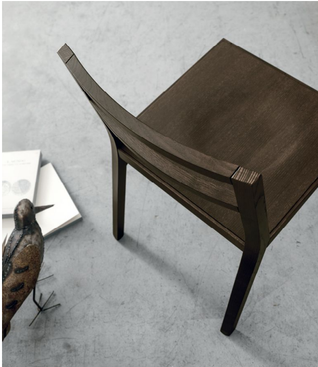
Sedie Bea struttura legno rovere termocotto. L 42 P 53 H 78/44 cm Bea chairs with a heat-treated oak wood frame. W 42 D 53 H 78/44 cm