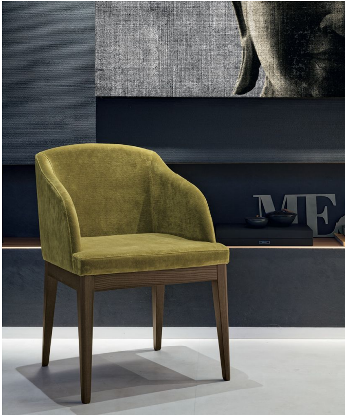
^ Sedia Lola struttura legno rovere termocotto, rivestimento cat. d nubes 10. L 55 P 53 H 81/47 cm