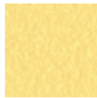
Pastel Yellow Steel