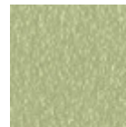
Sage Green Steel