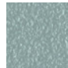
Light blue steel