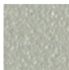
Light grey steel