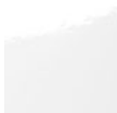
L7 polished white lacquered